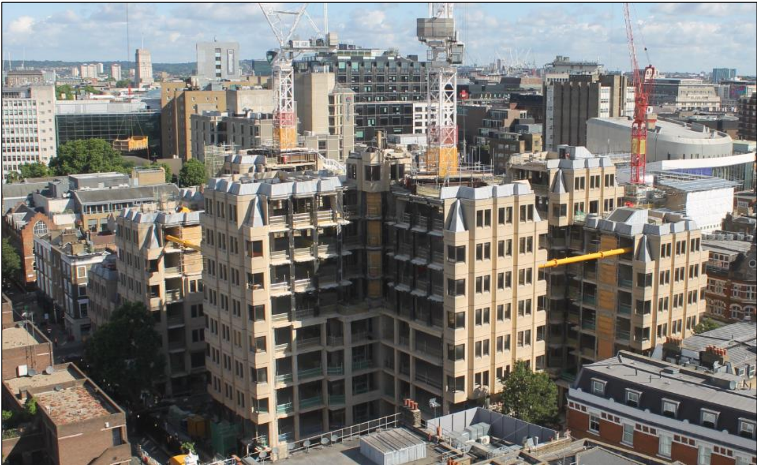
June project update from the 90 Long Acre Site Eye

For enquiries, please email enquiries@ccscheme.org.uk