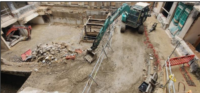
Unit 6 Ground Floor Demolition Commenced