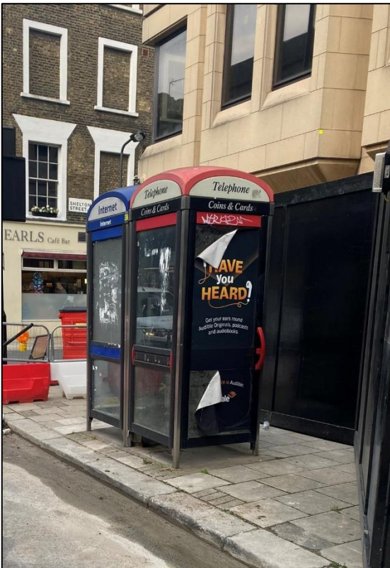
Phone box to be removed on the corner of Endell Street & Shelton Street

If you would like to attend one of the virtual drop-in surgeries, please get in touch at: 90LongAcre@kandaconsulting.co.uk to book a slot with the project team within the times provided above and we will provide you with a secure link to meet members of the team.